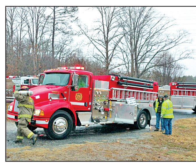
Firefighters responded to a house fire the morning of Sunday, Dec. 4, off old Blue Ridge Highway. The fire was quickly put